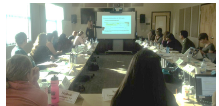
Open Door Community Health Centers' NP Residency Program (top). Northern California Rural Roundtable participants listen to a presentation on Alternative Payment Reform and health system transformation (middle). Hepatitis C 101 Course with UCSF Hep C ECHO subject matter experts and treaters (bottom).